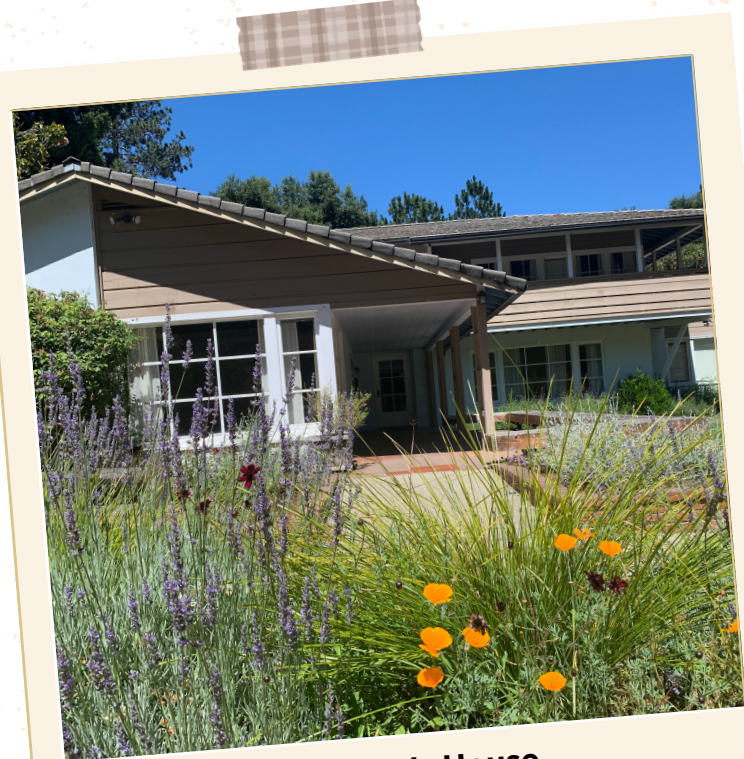
Highlands House 8500 CA-9, Ben Lomond Countryside mansion with a private lawn nestled in our enchanted redwood forest