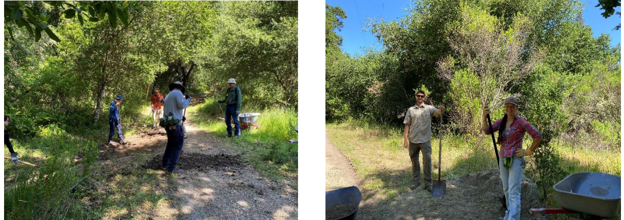
Volunteers and staff along the Discovery Loop

We recently were part of National Trails Day which was organized in our County by the Santa Cruz Mountain Trail Stewardship. At quail we had over 30 volunteers who helped fix the Discovery Loop from the damage from the winter storms. Some of our regular trail crew volunteers lead small groups along the trail. Maintenance staff help prepare for the day and delivered tons of material needed for the work. The volunteers raked, graded and moved tons of material up and down the trail. Come take a stroll the trail is in great shape!