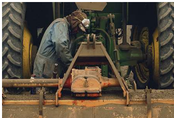
El Mecánico Photo Printed on Metal $300