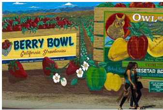
Berry Bowl Photo Printed on Metal $300

Photojournalistic curiosity and observations, coupled with a long time fascination with patterns, abstracts and juxtapositions, are at the root of “Berry Bowl.” Bright and shiny objects have always attracted my attention. Having recently discovered photography, I am excited to capture and share some of those observations and attractions. The Pajaro Valley is a long way from my childhood in the South Bronx. Living in the Pajaro Valley for the better part of four decades, the presence of berry related agriculture in the Pajaro Valley is a familiar sight. Apples and other crops are giving way to berries, but agriculture continues to dominate the Pajaro Valley landscape. Agricultural workers faithfully perform a variety of physically demanding jobs that often go unnoticed and underappreciated. The sociologist in me wants to ask, “What will be the future of these workers and their children? How will Watsonville and the Pajaro Valley respond to those changes?” Hopefully these images have caused you think about that subject or maybe you were just drawn to bright and shiny objects and patterns.