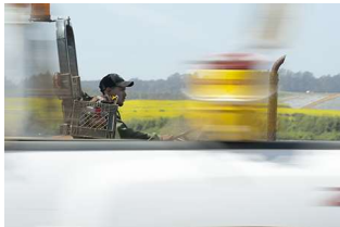
Serendipity Photo Printed on Metal $300