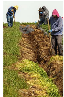
Palas Photo Printed on Metal $600