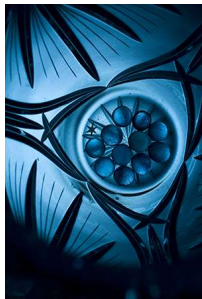
Azul Digital Print $500