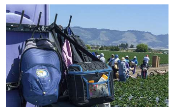
Untitled A Photo Printed on Metal $300

Please contact the artist for more information.