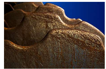
Disco Photo Printed on Metal $300